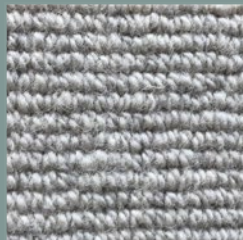
Canyon Stone 128