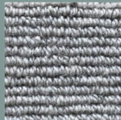
Wild Mushroom 121