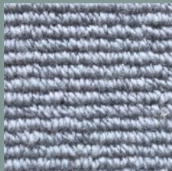
Sea Mist 119