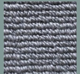
Scorched Earth 128

We have gone to great lengths to create the most idyllic wool carpets, from sourcing the highest quality raw materials, to working to achieve the most affordable price points, and of course, always creating the greatest comfort and quality flooring for our customers.