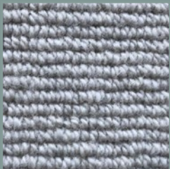
Harvest Straw 104